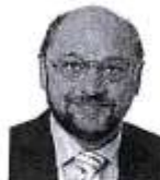
Martin Schulz MEP