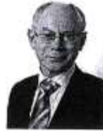
Herman Van Rompuy