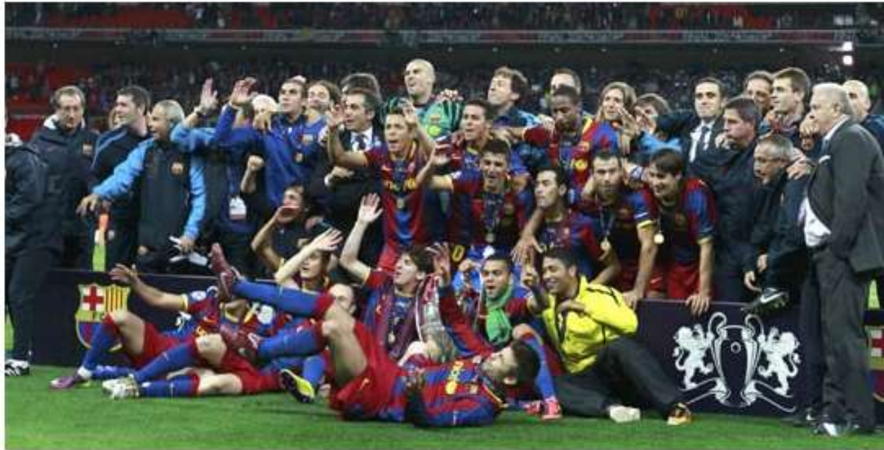
Barcelona's team celebrate with the trophy after winning their Champions League final soccer match against Manchester United at Wembley Stadium in London May 28, 2011.